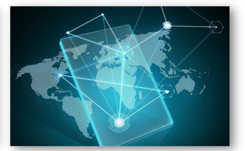
Preventative steps to avoid damaging links to financial criminals

Financial crime is a very real and evolving problem. It has been described as "a cancer on our society" and "an issue of international security." Not only is the scale of illicit activity in the trillions of £s, but the impact on all of our businesses, the economy and society is profound.