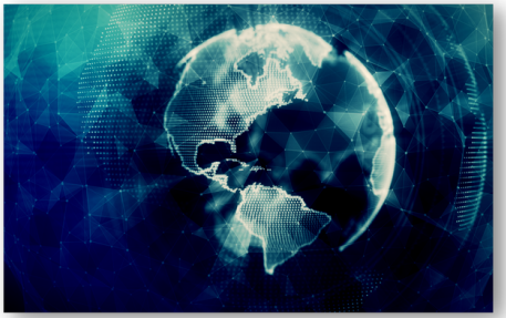
Threat-based analysis that educates and drives change